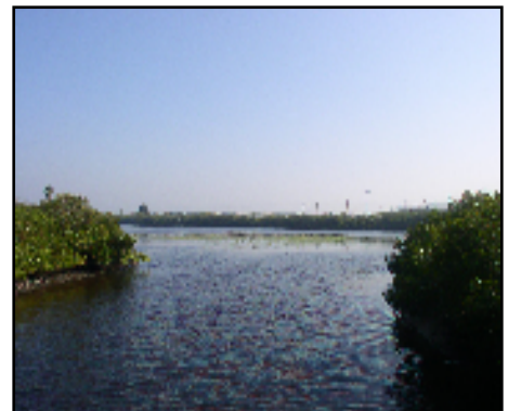
Cross Bayou Canal

The Cross Bayou Canal was created in the early 1900's to provide drainage and transportation for those living in the area now roughly defined as Pinellas Park and Largo. This area was not suitable for farming because of Lake Largo and the surrounding swampland. The Canal was so successful in draining the area that it completely drained Lake Largo and provided dry land for agricultural uses. This dry land became a haven for settlers, and over the last century, has seen a dramatic increase in development, including a large industrial area, which has had a negative impact on the quality of the water in Cross Bayou Canal. The Cross