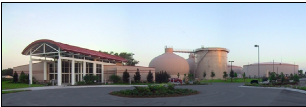
South Cross Bayou Water Reclamation Facility

enrich it with additional oxygen through the use of a cascade system. The sludge, or biosolids, that is removed during the water treatment process undergoes additional stages of treatment and is processed into a very high grade