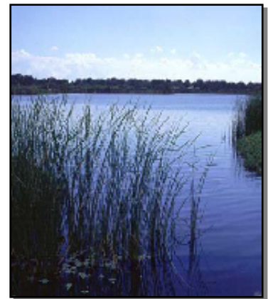
View of Lake Seminole

A bypass canal was constructed in the 1970's to drain runoff from the areas north and east of the lake directly into Long Bayou. The primary external water source to the lake is rain water. The runoff from rain events drain through several large conveyance systems