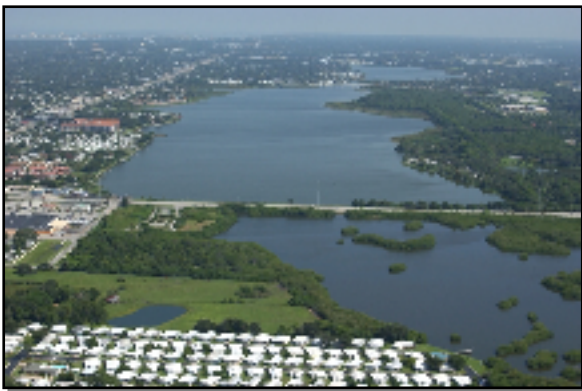
Aerial View of Lake Seminole

The Lake Seminole Diagnostic Feasibility Study was completed in 1991, and revealed that the lake had elevated nutrient concentrations, resulting in the hypereutrophic designation. The study attributed the declining water quality of the lake to over 131 stormwater pipes that discharged into the waterbody. These stormwater pipes, most of which were constructed prior to any kind of stormwater regulations, collected runoff from the highly urbanized Lake Seminole watershed and dispensed fertilizer laden water into the Lake Seminole aquatic ecosystem.