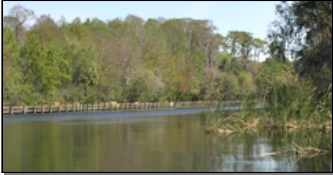
View of Lake Tarpon near Chesnut Park

The extent of this degradation became apparent in the summer of 1987 when a major algal bloom composed of blue-green algae ( Anabeana circinalis ), indicative of eutrophic conditions, covered almost 80 percent of the lake. The resultant fish kills and citizen reports of noxious odors and health concerns prompted the Pinellas County Board of County Commissioners to pass a resolution creating the Lake Tarpon Management Committee (LTMC).