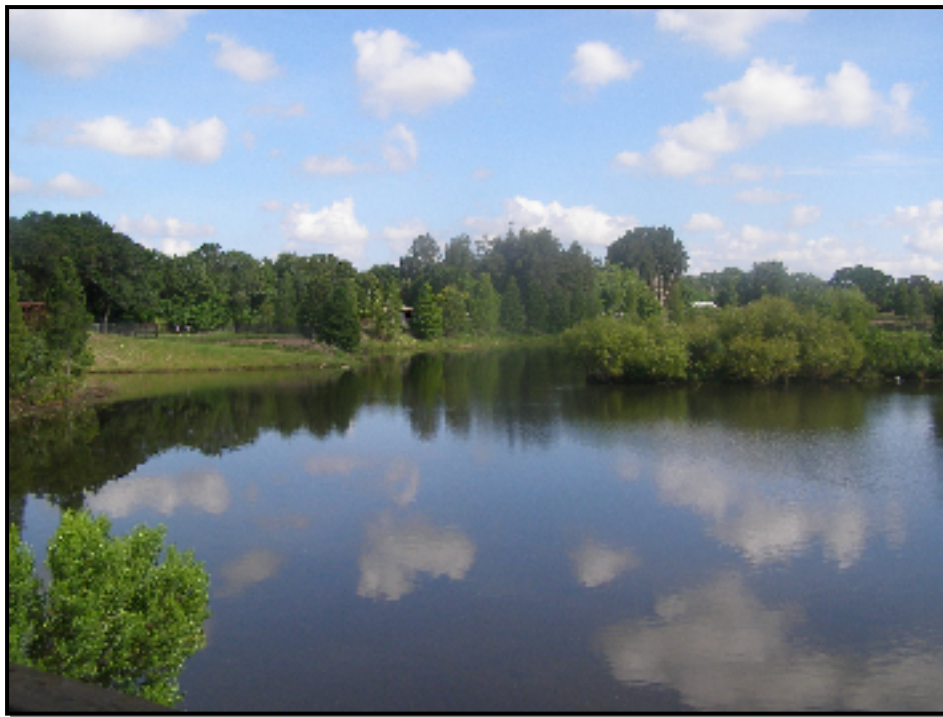
Joe's Creek Preserve

The Pinellas County Environmental Fund (PCEF) is a unique partnership between the Pinellas County Board of County Commissioners, the National Oceanic and Atmospheric Administration (NOAA), and the National Fish and Wildlife Foundation. These three groups share the common goals of actively pursuing the protection, restoration, and enhancement of Tampa Bay's natural resources. PCEF is funded by the Pinellas County Board of County Commissioners, the National Oceanic and Atmospheric Administration, and corporate and individual sponsors. The National Fish and Wildlife Foundation administers all grant awards on behalf of PCEF. Projects funded by PCEF support the Tampa Bay Estuary Program's Comprehensive Conservation and Management Plan. In 2006, PCEF provided partial funding for 15 projects, with additional monies leveraged for a total of $4.6 million to support Tampa Bay-focused restoration efforts.