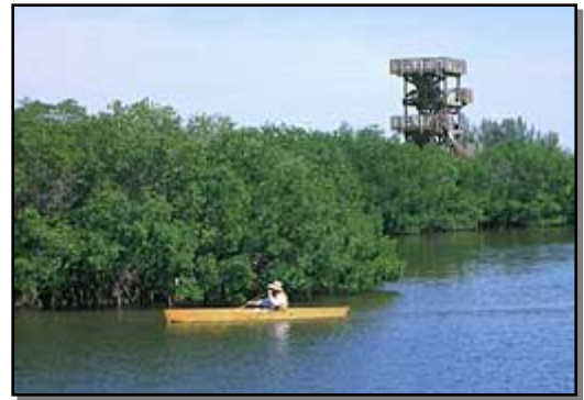
Kayaker at Weedon Island Preserve

The Weedon Island Preserve is another example of high quality open space in the County that is heavily dependent upon the water. This Preserve features miles of trails and boardwalks through the various environmental habitats, including palmetto and mangrove systems. Visitors to the preserve commonly hike the trails and kayak throughout the Preserve boundaries in the mangrove tunnels and among the natural spoil islands. Access to coastal surface waters makes this Preserve a popular destination for both tourists and local citizens.