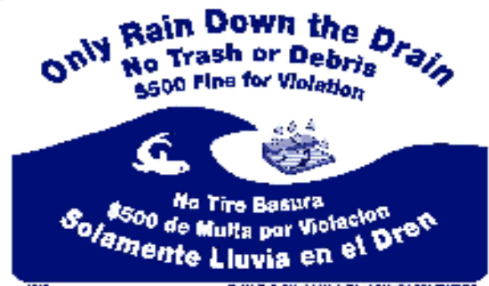
Example of a storm drain marker used in Pinellas County.

The storm drain marking program was initiated by the Department of Environmental Management in 1997 to educate citizens about what does and does not belong in storm drains. In Pinellas County, storm drains along the side of the street drain directly to a body of water. These drains are designed to channel stormwater from the roads directly to a receiving body of water. In an urban area such as Pinellas County, water flowing into the storm drains often takes a number of pollutants with it. Many citizens do not realize that storm drains do not flow to the sanitary sewer system, as many do in other parts of the country, and are not aware that the litter they leave on the streets and the fertilizers they apply to their lawns, can make their way into the storm drains and impact the quality of nearby surface waters, as well as impede flows and exacerbate flooding.