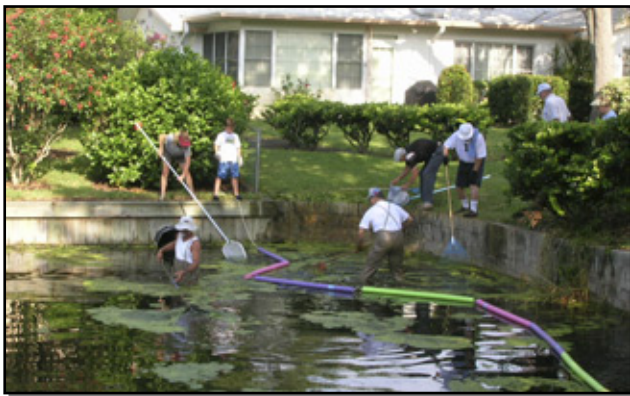
Volunteers working on a stormwater pond in Pinellas County.

Beginning in 2004 Pinellas County staffed an adopt-a-pond program, intended to help residents better manage their privately owned stormwater ponds. While this program is not currently operational due to budget constraints, it may be re-instated in the future depending upon the availability of funding. Common problems with stormwater ponds include algae blooms, fish kills, and non-native vegetation. Often these problems are made worse by a lack of native buffer and aquatic vegetation. Pinellas County selected applications from candidate ponds located in the unincorporated County, participants in the Department of Environmental Management's Lakes and Ponds Education Day workshops, complaints, and from referrals from other agencies.