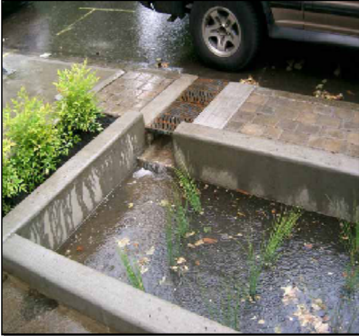
Swale on the side of an urban street that allows for the percolation and filtration of stormwater before it reaches a body of water.

According to TBEP, one common atmospheric contaminant locally is nitrogen oxide, most closely linked to power plant and vehicle emissions. Additionally, toxic substances such as cadmium, copper, lead and zinc also contribute to air, and subsequently, water pollution in the Tampa Bay watershed. These contaminants are most commonly associated with industrial emissions. For example, cadmium is associated with electroplating and battery production.