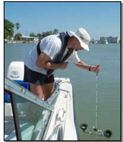
Water Quality Monitoring in Pinellas County

In 1990, directed by its recently adopted Comprehensive Plan, Pinellas County initiated a comprehensive water quality monitoring program. As of 2006, the Water Resources Section of the Pinellas County Department of Environmental Management (PCDEM) manages the only comprehensive ambient surface water monitoring program in Pinellas County and in 2006, monitored 684 sites in Gulf coast waters from the Anclote River to Ft. DeSoto, in Tampa Bay from Oldsmar to Pinellas Point and in Lake Tarpon and Lake Seminole. PCDEM also monitors approximately 50 sites in creeks and streams, covering many of the watersheds in the County, with the exception of those located within the City of St. Petersburg. Pinellas County is currently working on developing an interlocal agreement with St. Petersburg in order to begin monitoring within City limits. Operating consistent with its DEP-approved Quality Assurance (QA) Plan, data is analyzed at the County's Utilities Laboratory located on Ridge Rd. in Largo. As has been required by the State since 1982, and to facilitate data sharing among local, regional, State and federal agencies and governments, the Department of Environmental Management enters all of its water quality data into the STORET database, and provides its data to DEP for inclusion in their 305(b) Reports.