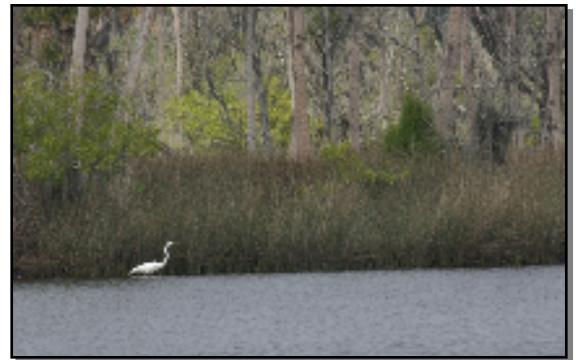
Wildlife within the Brooker Creek Watershed

One of the greatest concerns surrounding the Brooker Creek Watershed is the pace of development within it. Being part of the Wellhead Protection Area, Brooker Creek Watershed provides a vital source of freshwater to the residents in Pinellas, Hillsborough and Pasco counties. The soils in the watershed are generally sandy, allowing water to quickly pass from the surface to the aquifer, but do not thoroughly filter pollutants from the water. Nitrogen and bacteria are easily able to pass through the ground and into the aquifer, and becoming more of an issue as development brings more of these two pollutants into the watershed.