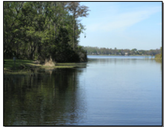
View of Lake Tarpon

The watershed of Lake Tarpon is approximately 60 square miles in size and consists of three drainage basins stretching primarily eastward into Hillsborough County. The largest of these basins is Brooker Creek which covers approximately 40 square miles and consists of large expanses of undeveloped land including the Brooker Creek Preserve. With relatively little development, this drainage basin's cypress swamps, and upland areas provide important aquifer recharge functions for local county wellfields. The basin surrounding the lake is approximately 9 square miles and consists of primarily urbanized land. The South Creek drainage basin is the smallest of the three basins covering an area of 3.3 square miles.