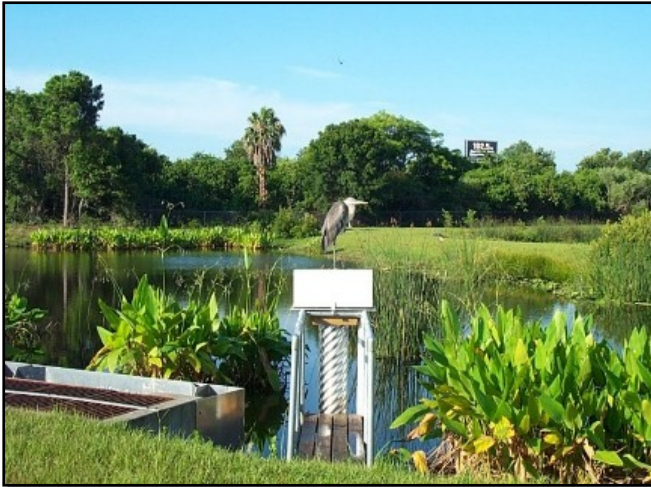
Water Quality Monitoring at a Pond in Pinellas County

In 1996, Pinellas County Environmental Management began sampling for benthic macroinvertebrates in Boca Ciega Bay and lower Tampa Bay as part of another TBEP collaborative bay-wide monitoring effort to assess sediment quality. This program is patterned after US Environmental Protection Agency's (EPA) Environmental Monitoring and Assessment Program (EMAP), which includes sediment grain-size analysis, sediment toxicity, water chemistry, water clarity, and benthic macroinvertebrates. Station locations are assigned using a random design based on EMAP protocols. In addition, special study areas are often included in the program. These areas are added to provide data on areas