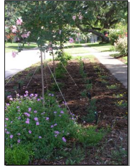
Example of a Florida-Friendly Yard in Pinellas County.

Florida Yards and Neighborhoods (FYN), a program in partnership with the University of Florida, plays an essential role in the education of local residents in regard to how their landscaping choices affect the environment and can be Florida-friendly. FYN seeks to address the problems of pollution in stormwater runoff, disappearing habitats and water shortages by educating the public and teaching conservation practices that can be utilized by every resident. By landscaping individual properties with native vegetation, the individual property-owner can contribute to controlling the quantity of surface water runoff and improving the quality of that runoff into surrounding bodies of water.