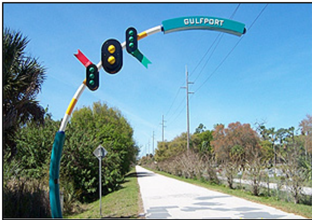
Public art along the Pinellas Trail adds visual appeal to location signs

County public art projects have been targeted for various facilities such as the St. Petersburg-Clearwater International Airport, the Pinellas County Courthouse, the Criminal Justice Center, the Brooker Creek Preserve and the Pinellas Trail. The public art program is coordinated on a project basis as funding becomes available through the annual budget process. Its purpose is to enhance the quality of life for Pinellas County residents as well as to support tourism and the economic vitality of the County through the enrichment of public spaces. The Cultural Affairs Department is currently building a database and contact list of public arts artists whose work may contribute to the program. Pinellas County adopted a Percent for Public Art ordinance that requires a percentage of major capital improvement projects' cost be set aside for public art. This program is overseen by the County's Public Art & Design Committee, a group of arts professionals, architects, government officials and citizens. At the municipal level, both St. Petersburg and the City of Oldsmar have ordinances that designate a percentage of City budgets for arts funding, and have Public Arts Advisory Commissions.