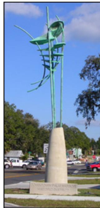
Public art in Downtown Palm Harbor